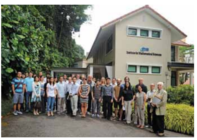
Group with infectious enthusiasm for viruses

It has been planned to publish some of the topics of this workshop in a special themed edition of Infection, Genetics, Evolution (IGE), which is one of the main journals within the field of phylogenetics.