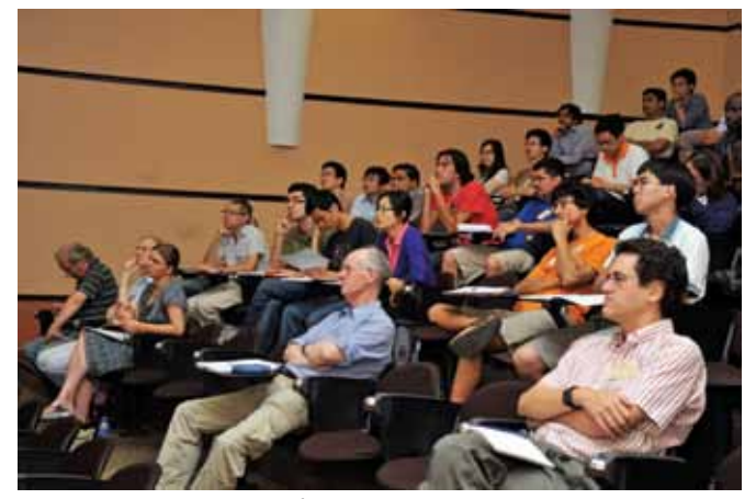
Captivated by the mathematics of biology

The first series of tutorial lectures and the first workshop focused on population biology and genetics. A frequently recurring theme was the influence of ecological processes, such as competition for resources, spatial distribution of populations, spatial and temporal variability in habitat, and (large scale) catastrophes, on inferences that are drawn from the standard population genetical models. In