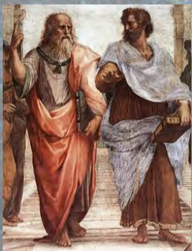
Plato and Aristotle

"The infinite! No other question has ever moved so profoundly the spirit of man."