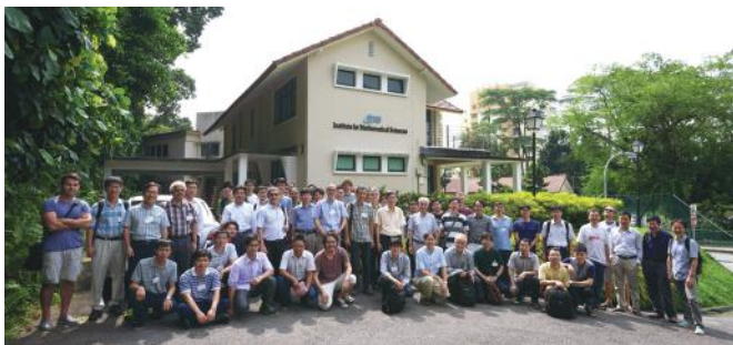
Dense set of periodic points under the action on algebraic geometry