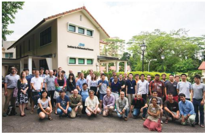
New Perspectives on Moduli Spaces in Gauge Theory