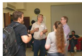
Increasingly distributed and interactive consensus