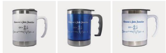
White mug with black lettering

IMS is happy to announce the launch of the new edition of the Riemann's Zeta Function mug! The new edition came in three designs.