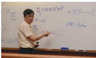
Jun-Muk HWANG: Cubic hypersurfaces and Legendrian manifolds