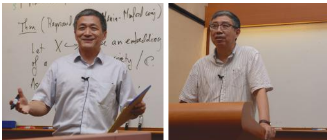
Shou-Wu ZHANG: Manin-Mumford conjecture and its dynamical analogue Gang TIAN: K-stability and Kähler metrics

Professor Gang Tian (Peking University and Princeton University) delivered his two-part lecture series on K-stability and Kähler metrics.