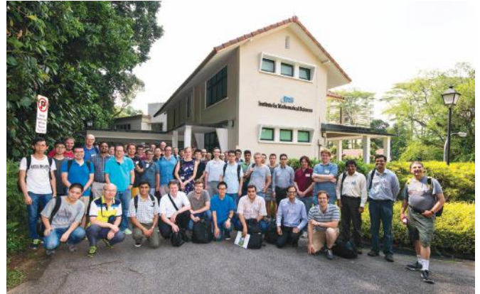
Mathematics of Information - Theoretic Cryptography