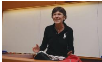
Hélène Esnault: Chern classes of automorphic bundles